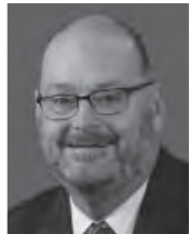
Paul Neidig Commissioner