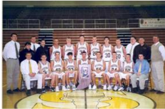
2001-02 IHSAA Class 2A Boys Basketball State Champion Speedway High School