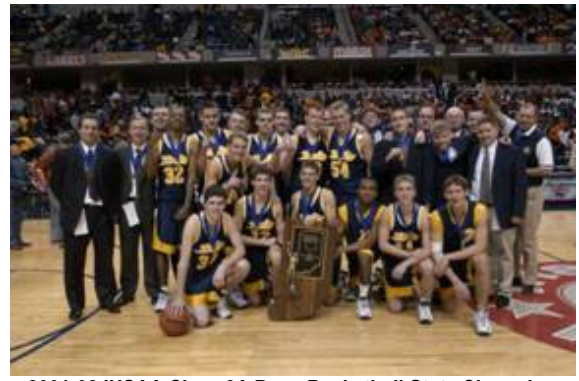
2001-02 IHSAA Class 3A Boys Basketball State Champion Delta High School