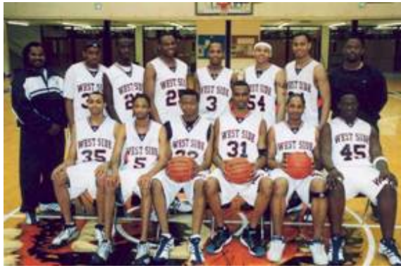
2001-02 IHSAA Class 4A Boys Basketball State Champion Gary West Side High School