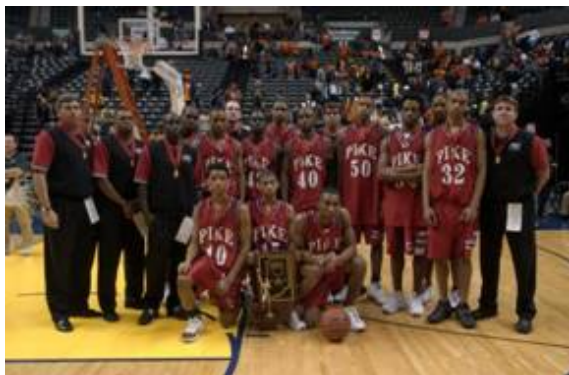
2001-02 IHSAA Class 4A Boys Basketball State Runner-Up Pike High School