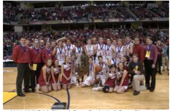
2001-02 IHSAA Class A Boys Basketball State Champion Rossville High School