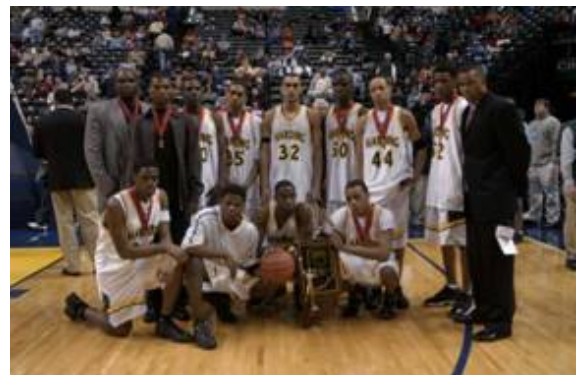
2001-02 IHSAA Class 3A Boys Basketball State Runner-Up Harding High School