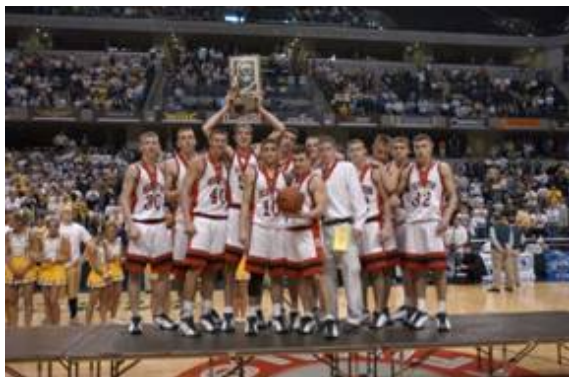
2001-02 IHSAA Class 2A Boys Basketball State Runner-Up Bluffton High School