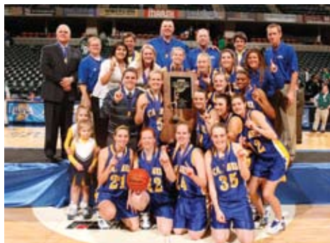
2008 IHSAA 4A Girls Basketball State Champion Carmel