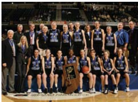
2008 IHSAA 2A Girls Basketball State Champion Heritage Christian