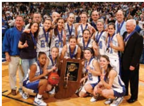
2008 IHSAA A Girls Basketball State Champion Fort Wayne Canterbury