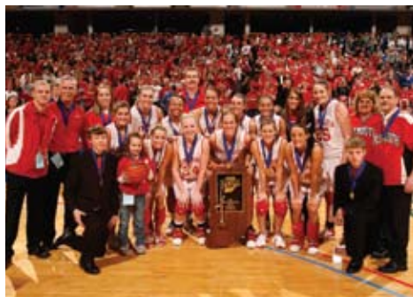
2008 IHSAA 3A Girls Basketball State Champion Plymouth