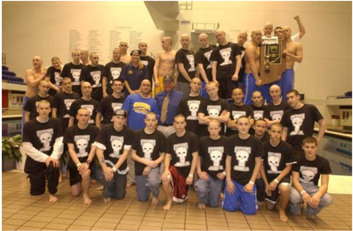
2002-03 Boys Swimming & Diving State Champion Carmel High School