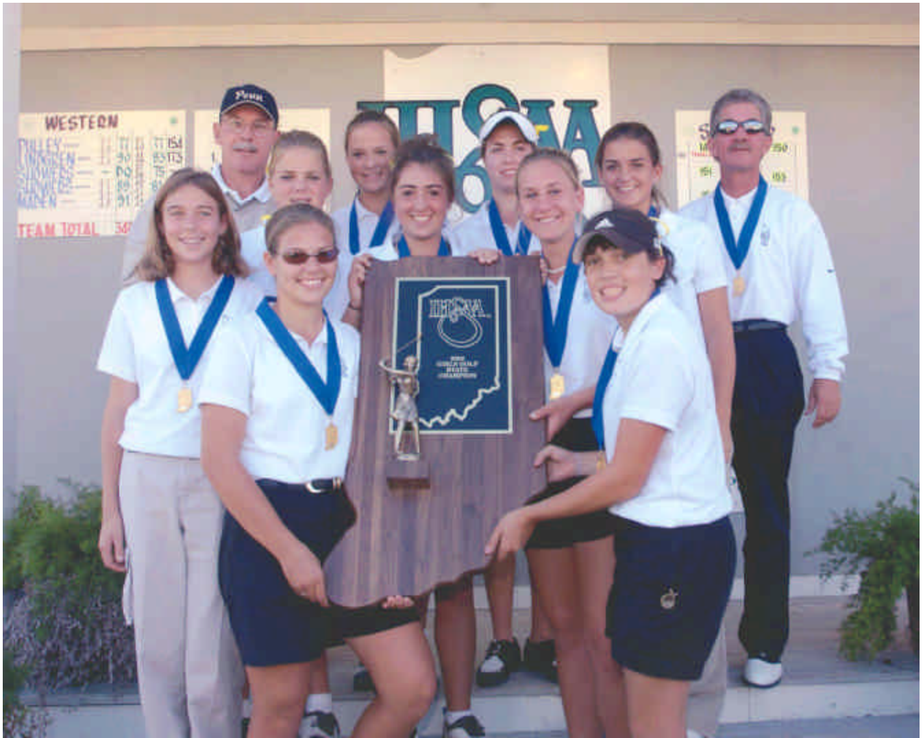
2002-03 IHSAA Girls Golf State Champion Penn High School