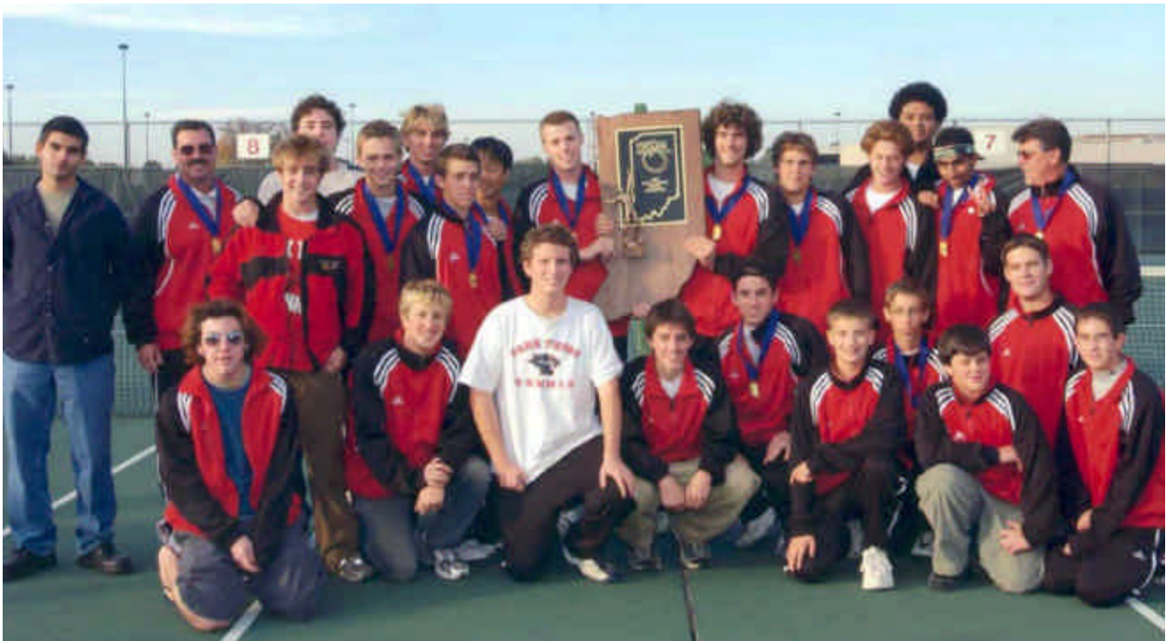
2002-03 IHSAA Boys Tennis State Champion Park Tudor HS

Friday's quarterfinal matches were forced indoors due to steady rain throughout the day. Saturday's semifinal round matches, though never threatened by rain, were delayed by over an hour due to moisture on the courts.