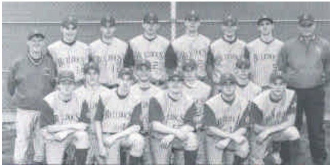
2001-02 IHSAA Class 2A Baseball State Runner-Up Batesville HS