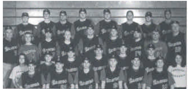
2001-02 IHSAA Class A Baseball State Runner-Up Tecumseh HS