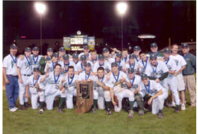
2001-02 IHSAA Class 3A Baseball State Champion Vincennes Lincoln HS