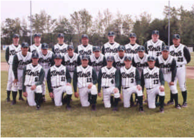
2001-02 IHSAA Class 4A Baseball State Runner-Up Evansville North HS