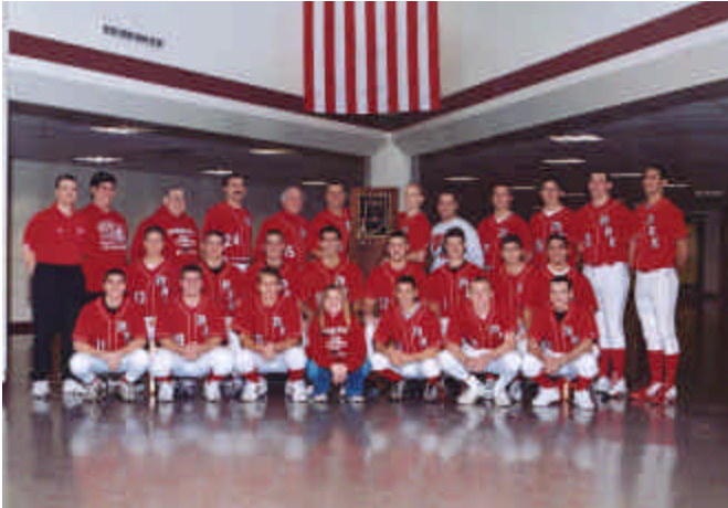
2001-02 IHSAA Class 4A Baseball State Champion Munster HS