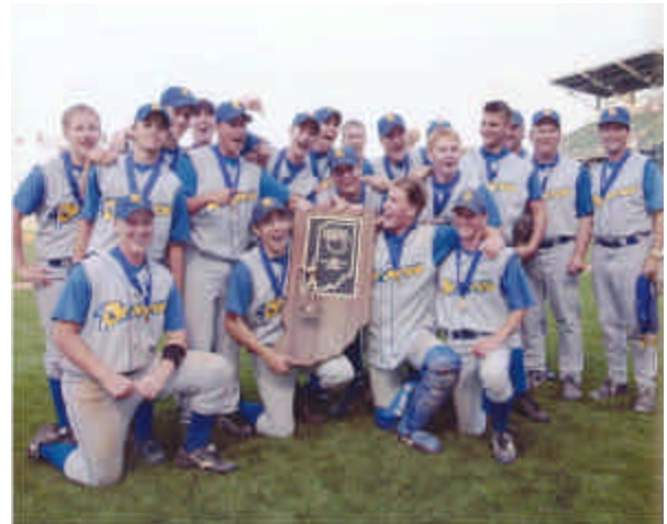
2001-02 IHSAA Class A Baseball State Champion Fort Wayne Blackhawk Christian HS