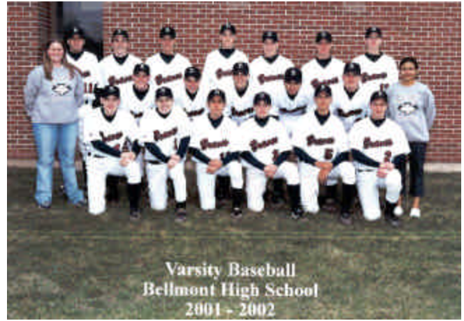
2001-02 IHSAA Class 3A Baseball State Runner-Up Bellmont HS