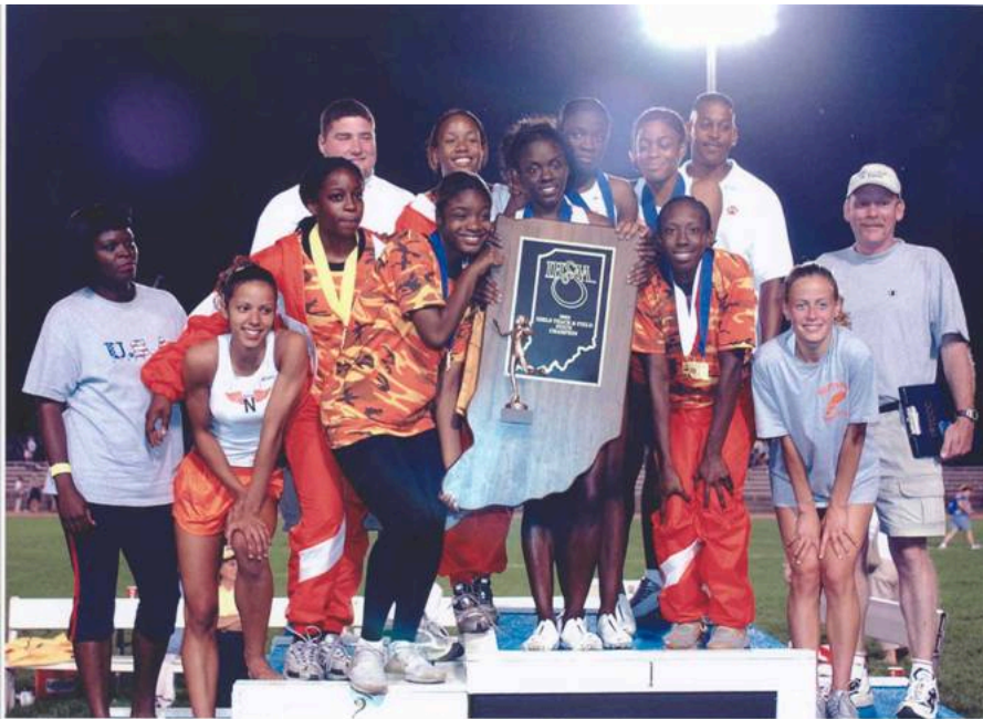
2002-03 IHSAA Girls Track & Field State Champion Fort Wayne Northrop High School

This year's tournament series drew 365 teams and 6,053 participants at the sectional level.