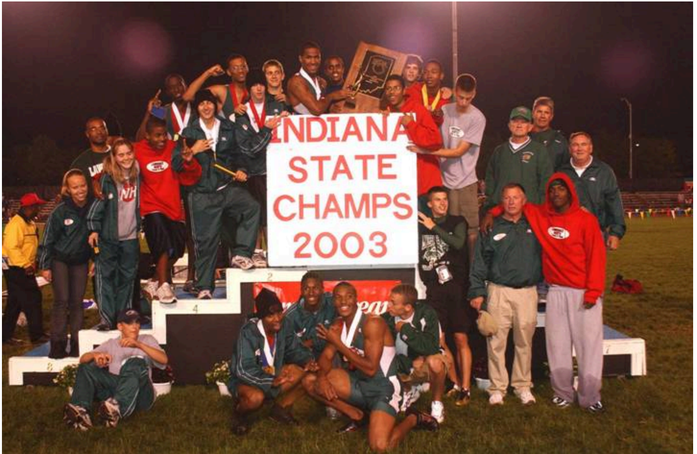
2002-03 IHSAA Boys Track & Field State Champion Lawrence North High School