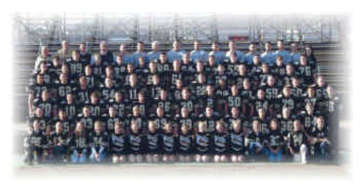
2001-02 IHSAA Class 4A Football State Champion Jasper HS