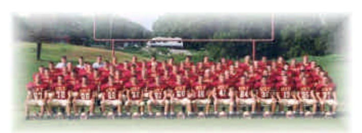
2001-02 IHSAA Class 2A Football State Runner-Up Evansville Mater Dei HS