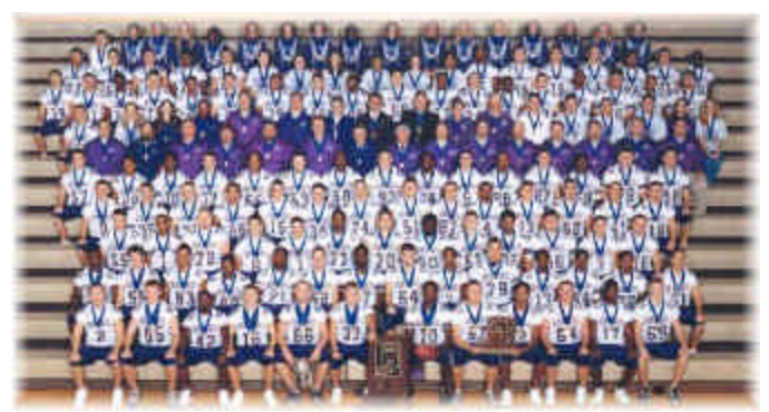
2001-02 IHSAA Class 5A Football State Champion Ben Davis HS