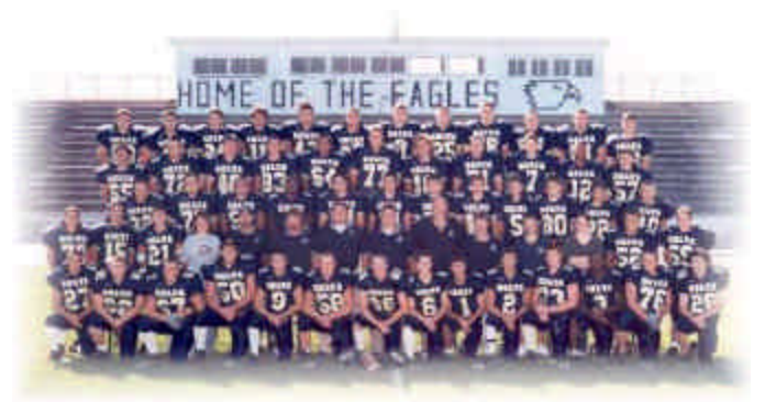
2001-02 IHSAA Class 4A Football State Runner-Up Delta HS