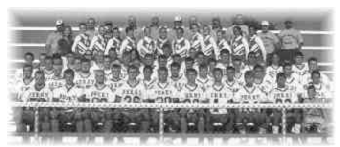
2001-02 IHSAA Class A Football State Runner-Up Perry Central HS