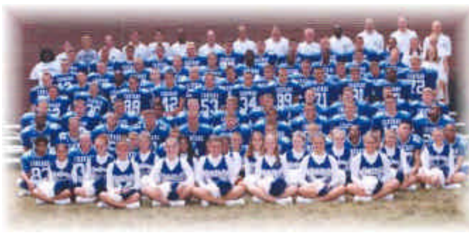
2001-02 IHSAA Class 3A Football State Champion Indianapolis Bishop Chatard HS