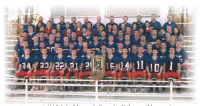
2001-02 IHSAA Class A Football State Champion Southern Wells HS