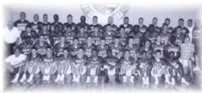
2001-02 IHSAA Class 3A Football State Runner-Up Andrean HS